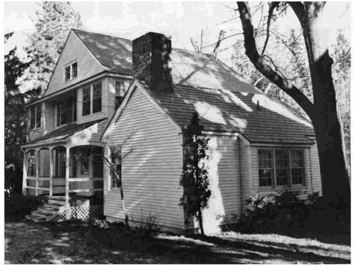
This turn-of-the-century, six bedroom home has a new 4,500 square-foot copper shingle roof from Zappone Manufacturing Co., Spokane. Owners of the copper-roofed house report "All the neighbors, even people just driving by, stop and say, 'Boy, that's really beautiful. Congratulations.'"

What was not anticipated, however, was that the eruption of Mount St. Helens would put an inch of ash on the roof, and speed up the patination process by about five years.